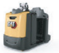
Tow Truck: 3.0 – 5.0 tonne capacity