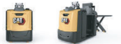
Order Pickers: 1.0 – 2.5 tonne capacity