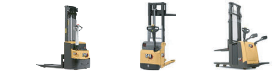
Stacker range: 1.0 – 2.0 tonne capacity