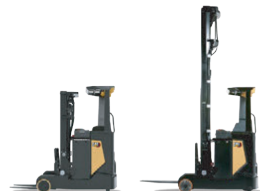
Reach Truck range: 1.4 – 2.5 tonne capacity