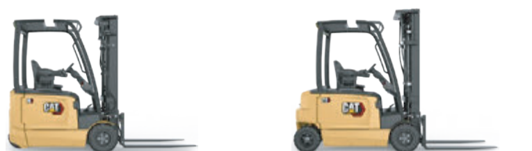
Electric range: 1.4 – 5.0 tonne capacity

The range covers every warehousing application, including demanding environments and operation in extremes of temperature, such as cold stores.