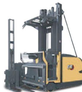
Man-Up Turret Truck: 1.1 – 2.0 tonne capacity