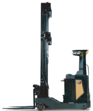
Multi-Way Reach Trucks: 2.0 & 2.5 tonne capacity