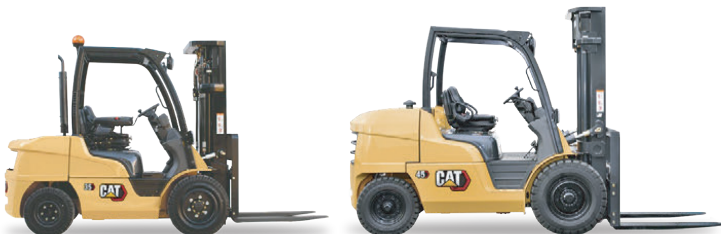
Diesel range: 2.0 – 10.0 tonne capacity