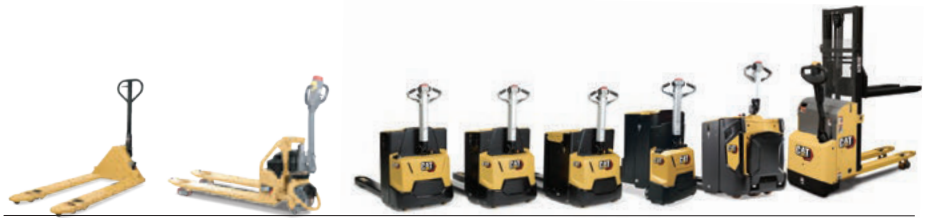
Hand / Power Pallet range: 1.2 – 2.5 tonne capacity

Whatever the product you handle, whichever way your warehouse operates, whatever racking configuration you have in place, there's a Cat Lift Trucks solution just waiting to help you optimize warehouse efficiency and your return on investment.